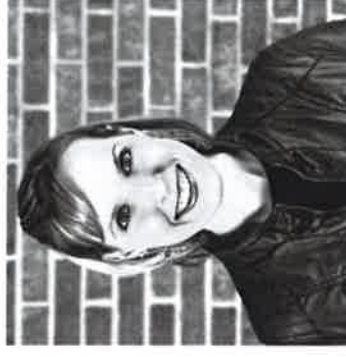
WEEKEND WORSHIP BAND